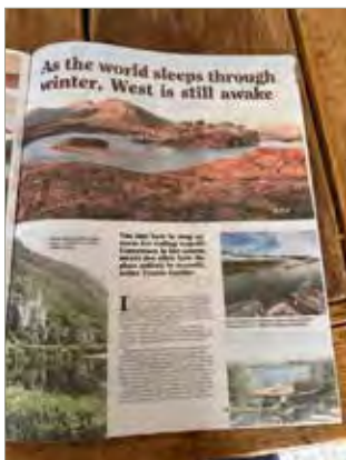
The Examiner Feb 24