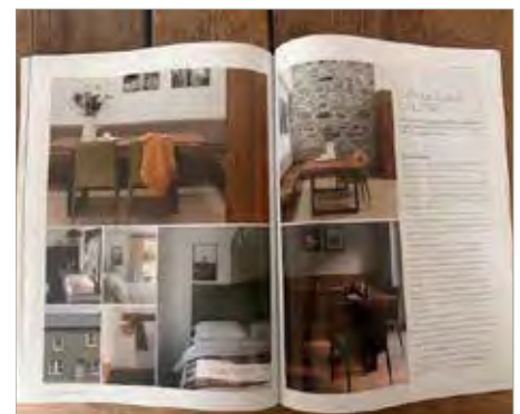
Galway Now March 24