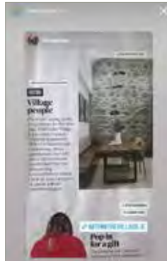
Sunday Independent Oct. 23