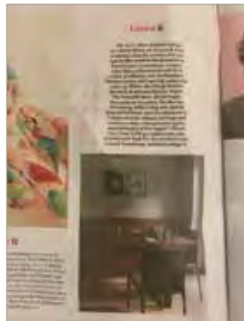
Saturday Independent Feb 24