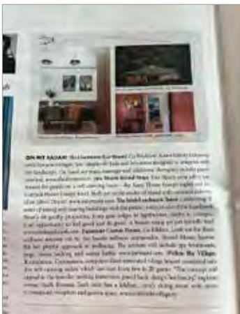
The Gloss, January 2024