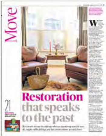
Sunday Times Oct. 2023

A number of journalists and media people came to stay at Within the Village over the winter months and experience true Connemara in the off-peak time of the year. This resulted in some very positive press for Within the Village and the greater Connemara region. Hopefully this will continue into the future and keep destination Roundstone, Connemara and Within the Village on the map!