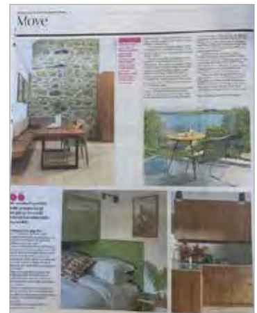
Saturday Times Feb 24