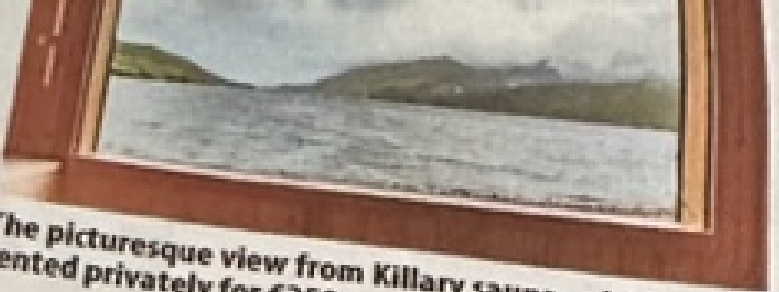
The picturesque view from Killary sauna, which can be rented privately for €250.

om €350 per night or a three-bed can be taken to- nthevillage.ie. llary Harbour e price for up guest, up to k from