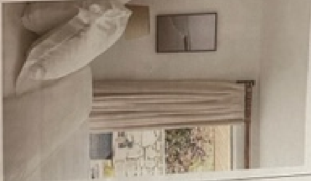
The view from the bedroom at the house is beautiful.