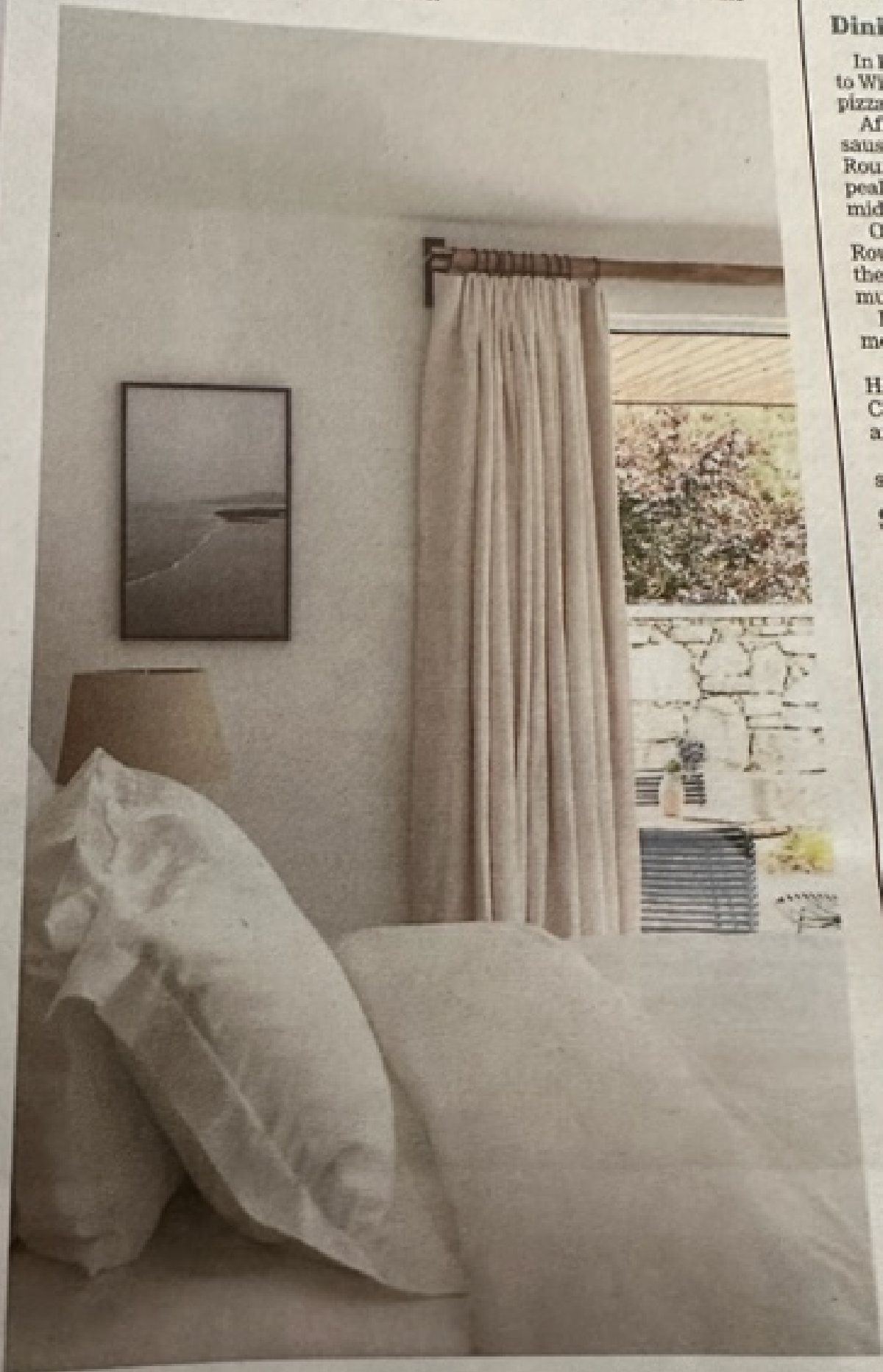
(Left) The rugged majesty of Connemara National Park. (Below) Discreet luxury in one of the bedrooms of the boutique self-catering townhouses of Within the Village, in Roundstone village, Connemara.