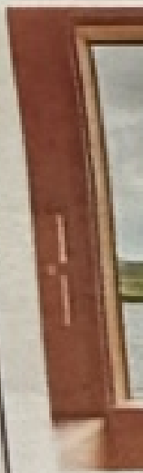
The pic rented