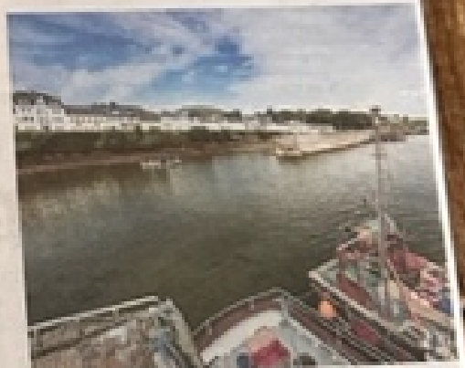
(Above) Roundstone, Connemara. (Below) A brass breakfast with superb views at Within the Village in Roundstone.

The reward at the top is views across Connemara, mountains and lakes punctuating swathes of rough brown and orange bog. There are patches of dark forest, scatterings of rock and blue-grey sea inlets. It