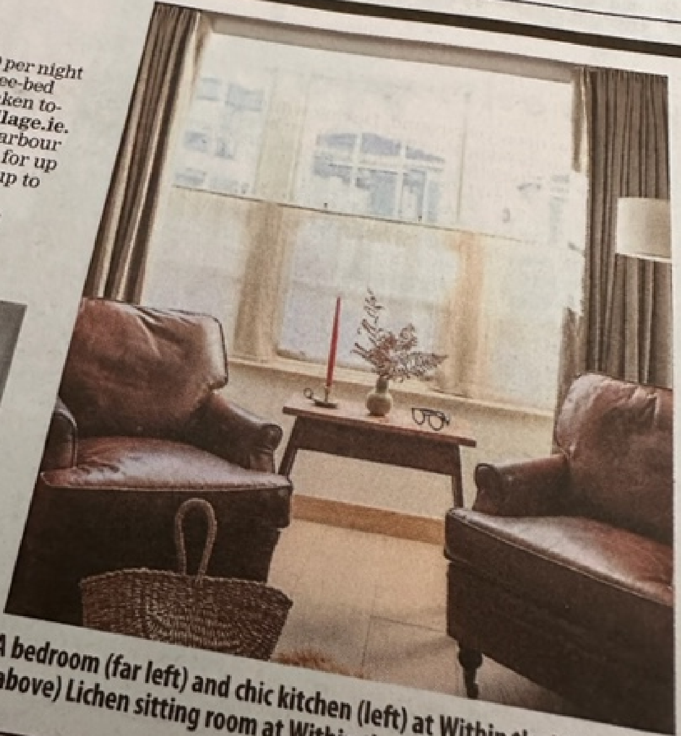
A bedroom (far left) and chic kitchen (left) at Within the Village, and (above) Lichen sitting room at Within the Village.

om €350 per night or a three-bed can be taken to- nthevillage.ie. llary Harbour e price for up guest, up to k from