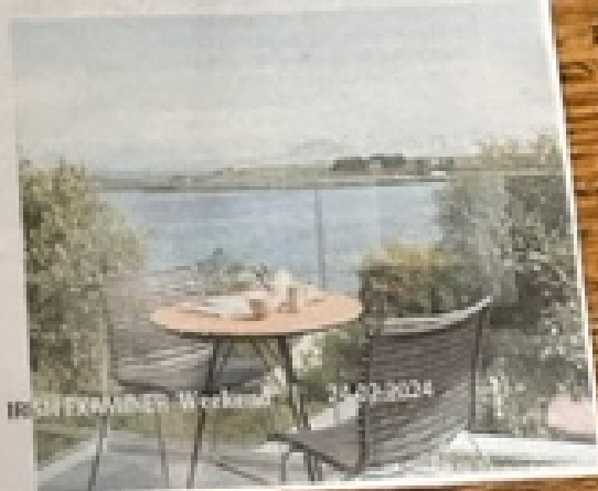
FROM DOMINATE: Weekend 21-23-2024