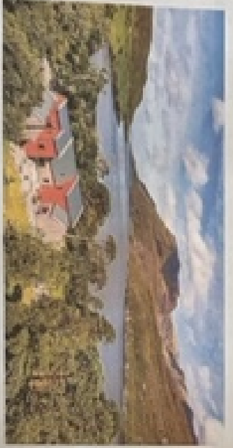
Many enjoy the view from the house.